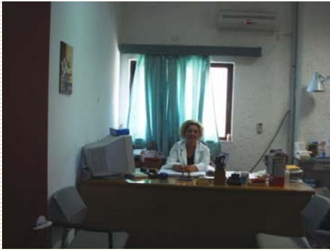
The general practitioners - above and below