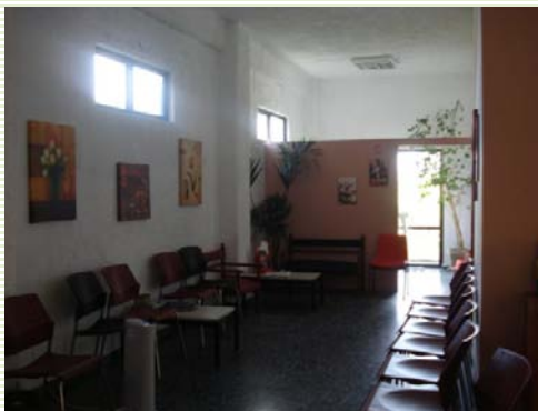
The waiting room