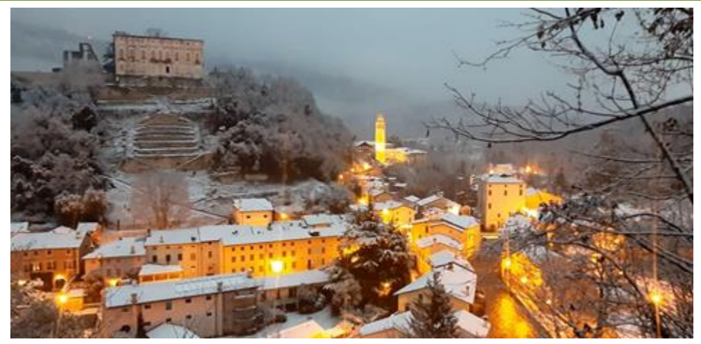
Polcenigo and its castle overlooking the village under the snow.