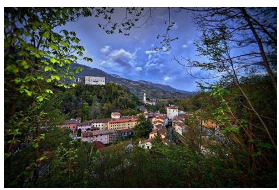
A view of Polcenigo and its small historic centre.