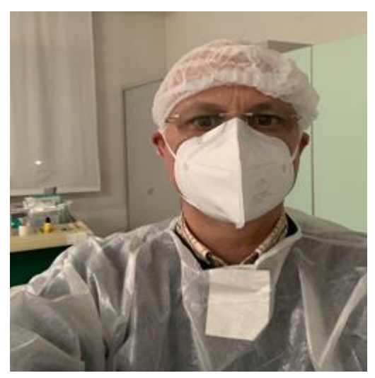
Me with the personal protective equipment in October 2020

Today, the access to my practice is allowed after a telephonic triage and by appointment only. At the entrance, my wife measures the temperature of the incoming patients with a digital thermometer, then invites them to disinfect their hands and to keep their masks on, covering their nose and mouth.