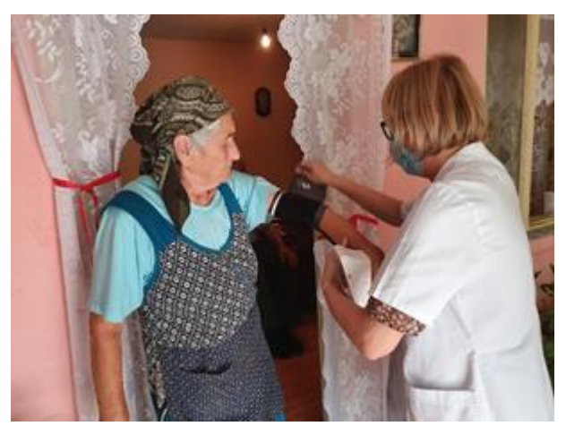
Figure 5: Community nurses at-home visit for elderly people

At this moment, in the village, we (3 GPs) are working together, one pneumologist and one internal medicine doctor. At the same time, the former hospital was transformed into a Medical-Social Unit where patients with chronic diseases and social problems are hospitalized. Two community nurses are completing the primary care team.