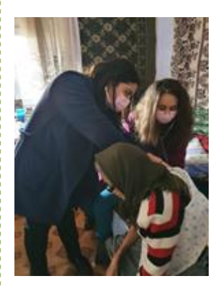
Figure 8: Students in home visit

Because I am a Lecturer at the University of Medicine and Pharmacy in Craiova, the sixth-year students benefit from a one-week internship in my office by rotation. This is very important because it provides an early exposure of students to the work of a rural office, which should increase the level of acceptance of a career in these conditions.