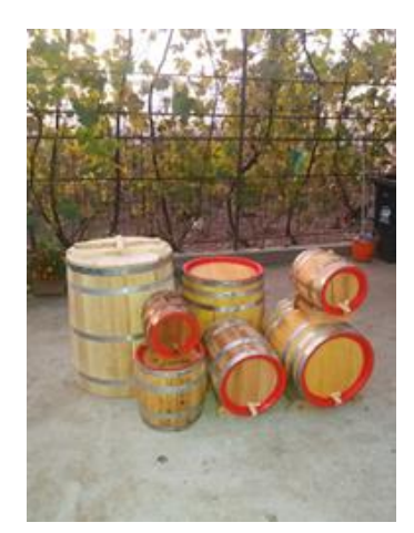
Figure 4 Traditional barrels