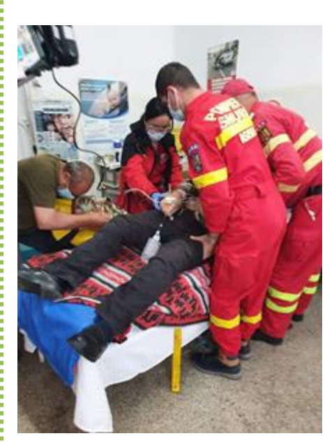
Figure 6: The emergency situation in my office

far away. For this reason, in addition to the scheduled consultations, our activity is marked by interventions in case of emergency. The role of the GP extends to resolving the emergency or providing first aid until the patient is sent by ambulance to the emergency rooms of the 2 hospitals.