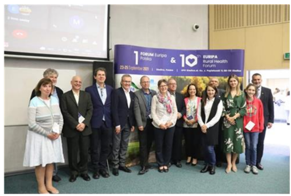
The organisers and keynote speakers at the end of the 10<sup>th</sup> Forum.

The Book of Abstracts has now been published in Year 2021, No. SUPPLEMENT 2, Volume 15 | Medical Science Pulse. You can find it at: